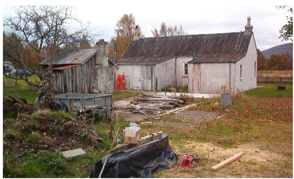
Fig. 4. Rear of existing house to be replaced

2. Following negotiations with the applicant's agent, a revised proposal has been submitted from that originally considered at the call-in stage. The proposal is to demolish the existing house and the remaining outbuildings and construct a new replacement house of a more contemporary design. The new house is 2 storey and is to be built approximately on the solum of the existing house, although it will be angled more to the south. Accommodation comprises on the ground utility/garage/storage space and two bedrooms, and on the upper floor the main bedroom and an open plan living/dining and kitchen space. Glazing areas and an upper floor decking area are designed to maximise the views to the south and south east. A steep slate grey corrugated metal roof, with angled gable ends is proposed. The walls will be finished in mainly timber cladding which is indicated as being stained in a mixture of dark blue and claret. The rear elevation will be a white wet harl. Solar panels are proposed.