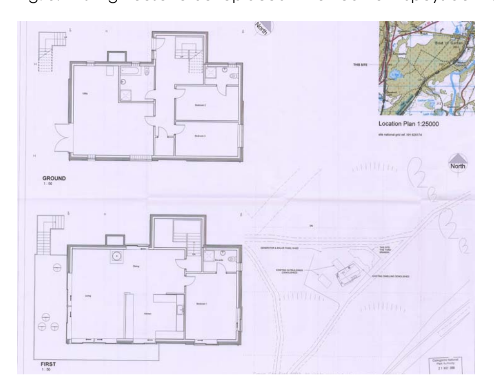
Fig. 6 Site and floor plans of new house