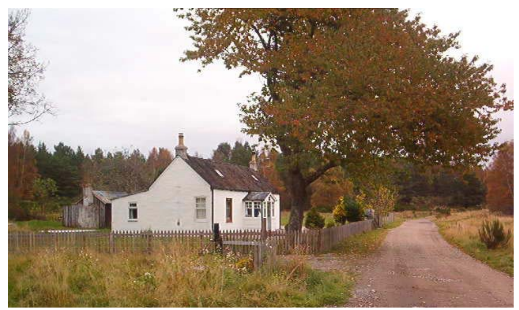
Fig. 5. Existing house to be replaced – viewed from Speyside Way